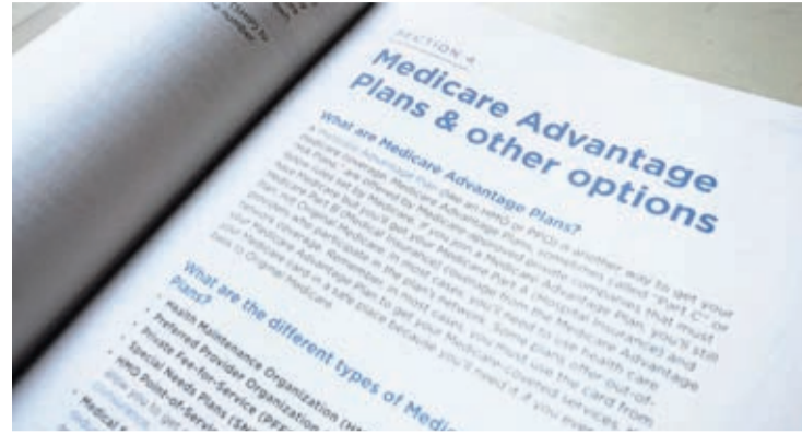
This Nov. 8, 2018 file photo shows a page from the 2019 U.S. Medicare Handbook in Washington.